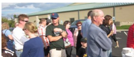
It wouldn't be a party without food! The hungry crowd lines up at the food table

Thanks to all who attended or helped with our annual Pig Roast on September 18! Special thanks to Dave Hayslip and his band for keeping the party lively!